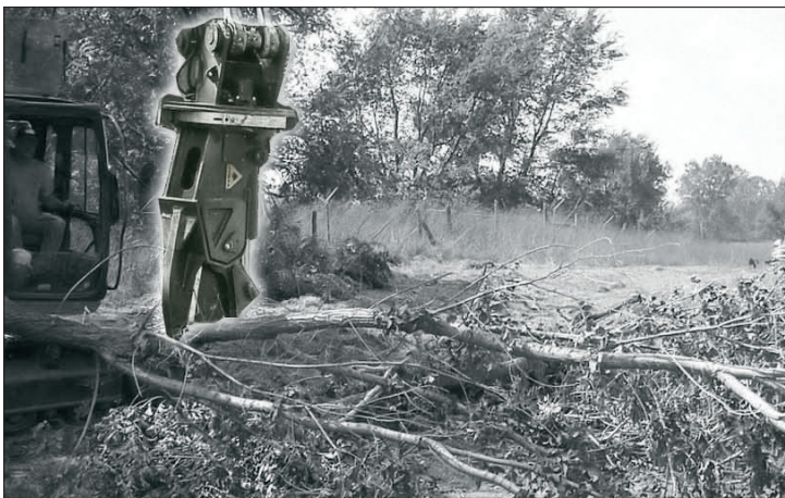
Dymax Limb Shear doing what it does best: making short work of limbs and trees.