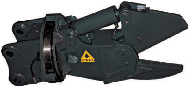
DX-TS-RLS-14in-HX Model 14in (36cm) model for 15-20T excavators 4,500 psi cylinder ram.