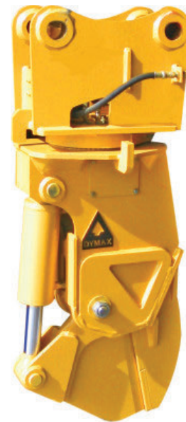
DX-TS-RLS-10in-HX Model 10in (25cm) model for 11-14T excavators 3,000 psi cylinder ram.