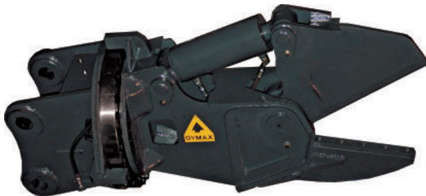
DX-TS-RLS-14in-HX Model 14in (36cm) model for 15-20T excavators 4,500 psi cylinder ram.