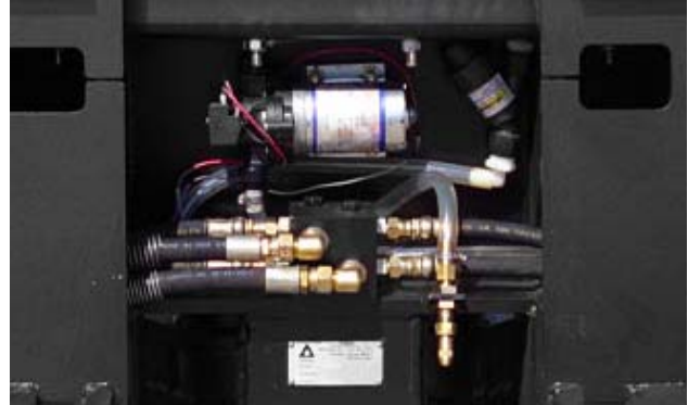
Dymax 14" Ranch Axe Tree Shear sprayer system eliminates re-growth of stubborn trees.