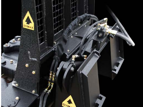
Photo Above: Dymax 14" Ranch Axe Tree Shear with hydraulic rotation. Supplied with diverter valve. Allows operators to rotate 90 degrees.